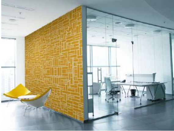
Vnext Premium Sandstone