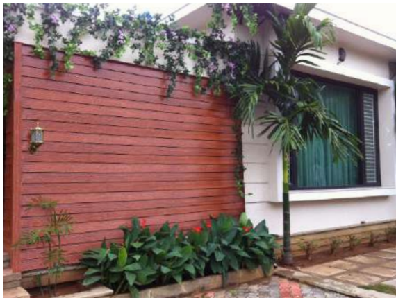
Vnext Premium Planks